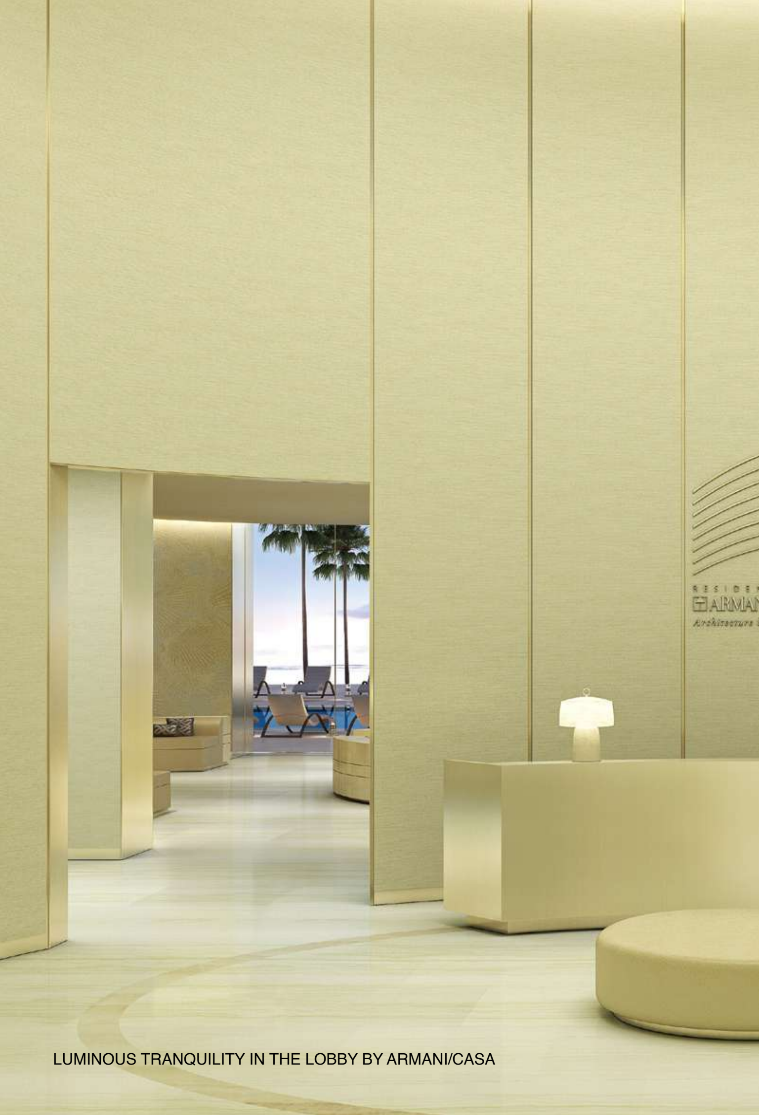
LUMINOUS TRANQUILITY IN THE LOBBY BY ARMANI/CASA