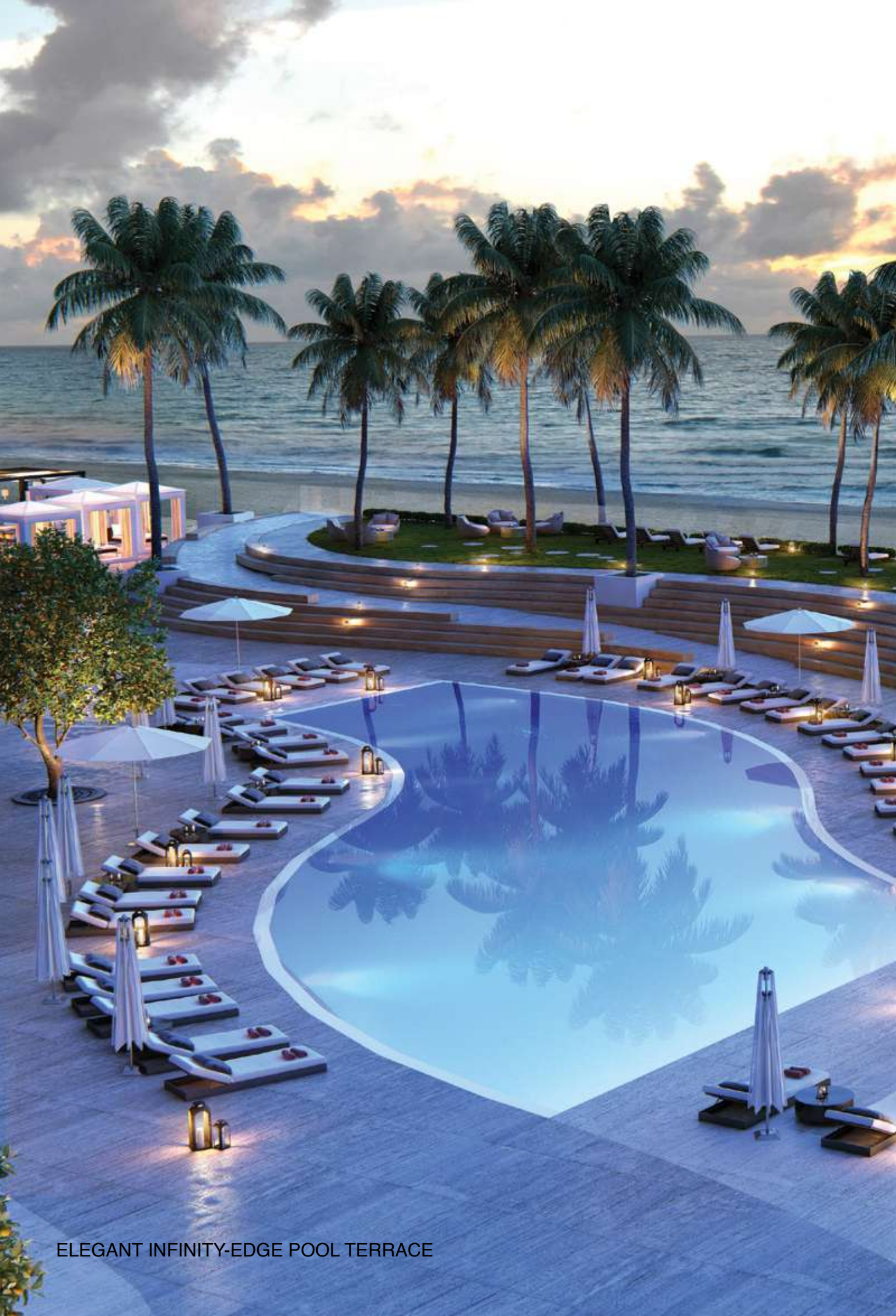
ELEGANT INFINITY-EDGE POOL TERRACE