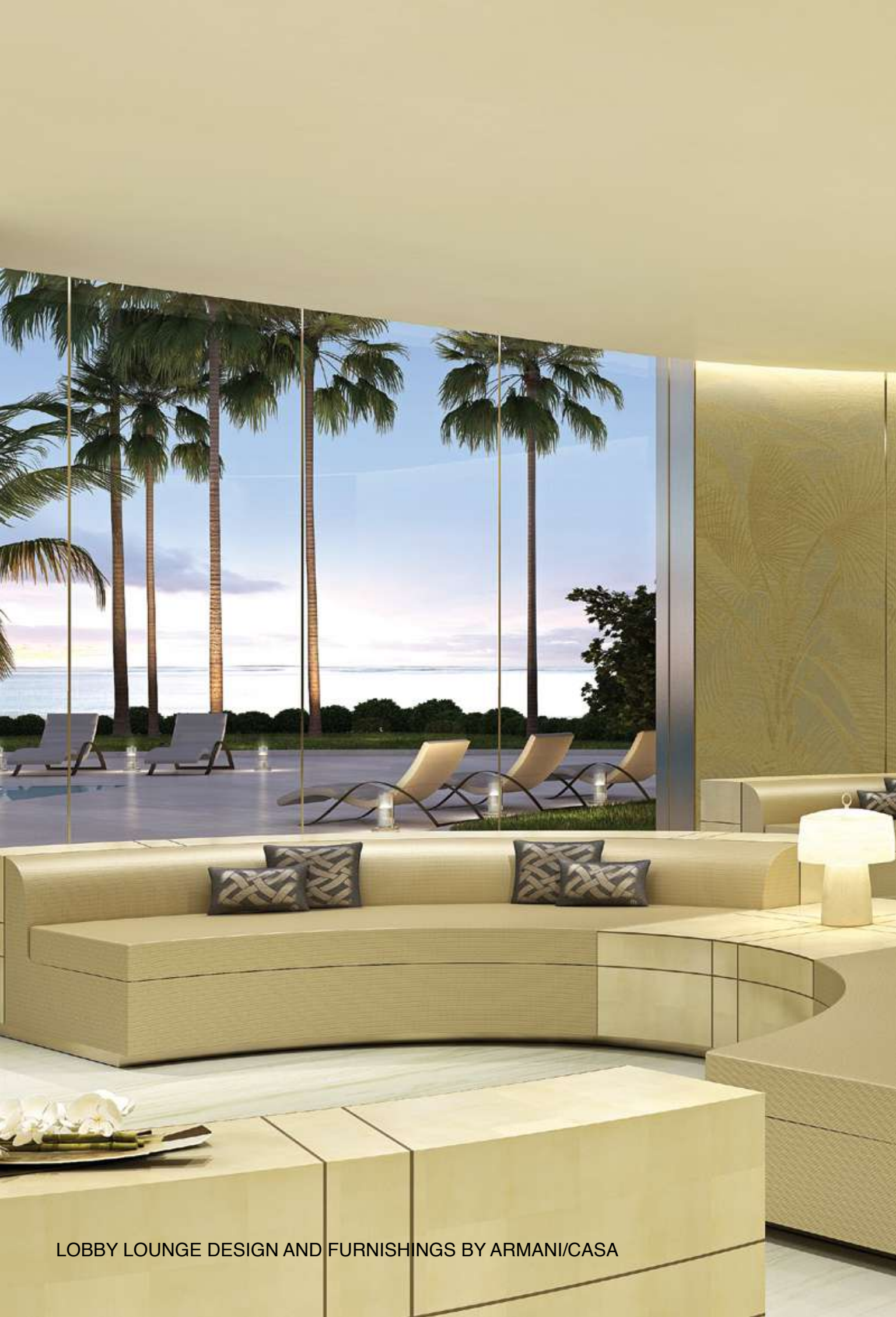
LOBBY LOUNGE DESIGN AND FURNISHINGS BY ARMANI/CASA