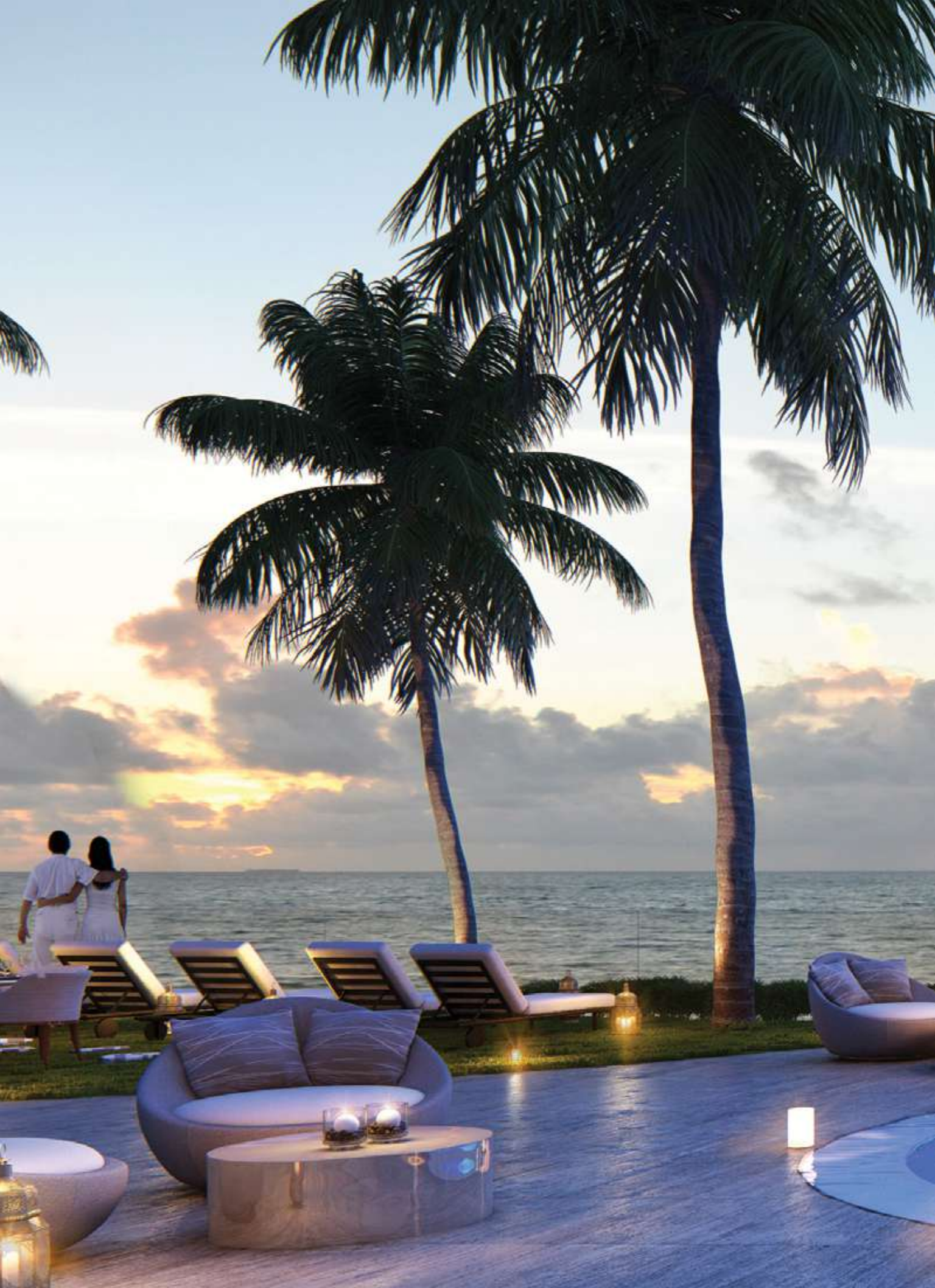
SUNSET TERRACE WITH HEATED SPA ON THE ATLANTIC OCEAN