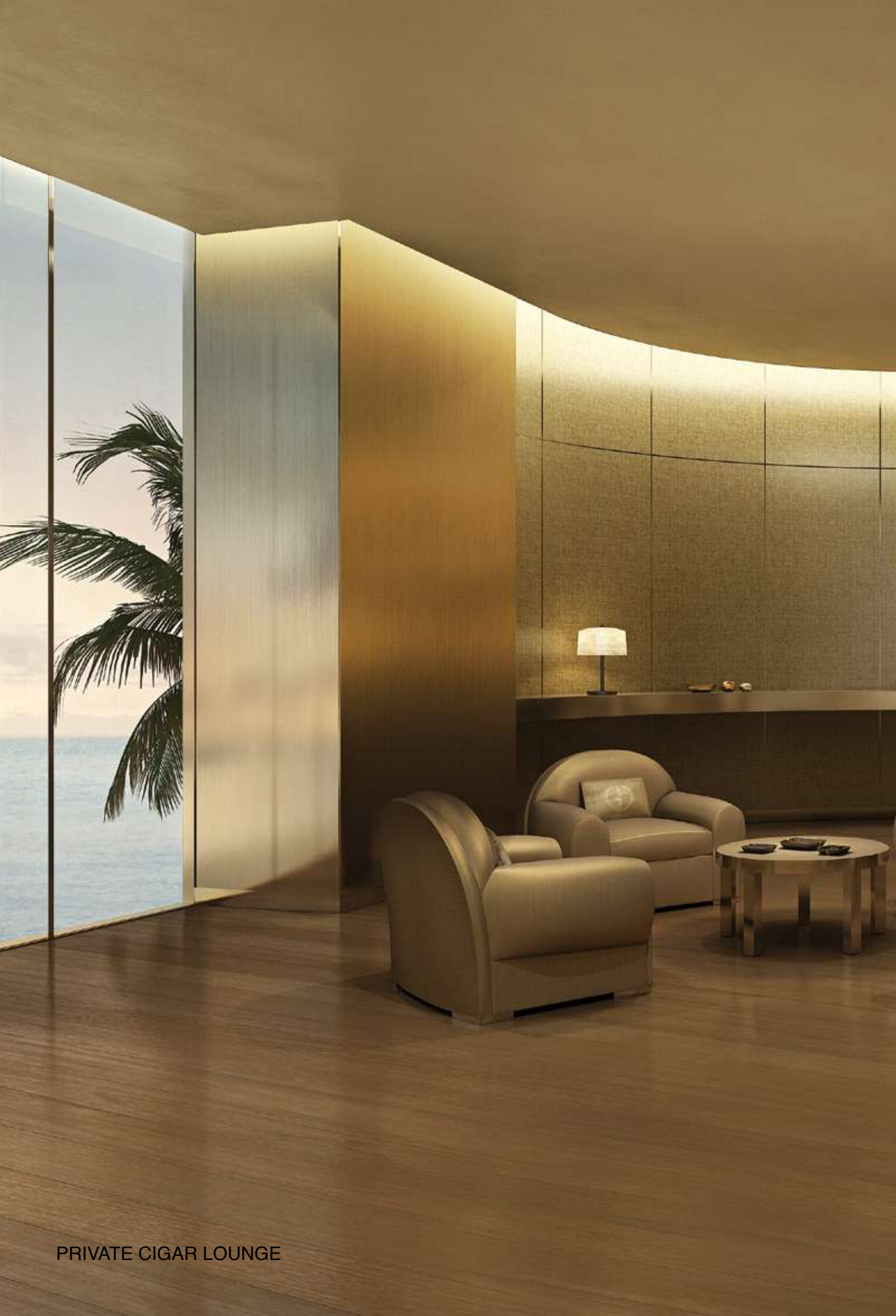
PRIVATE CIGAR LOUNGE