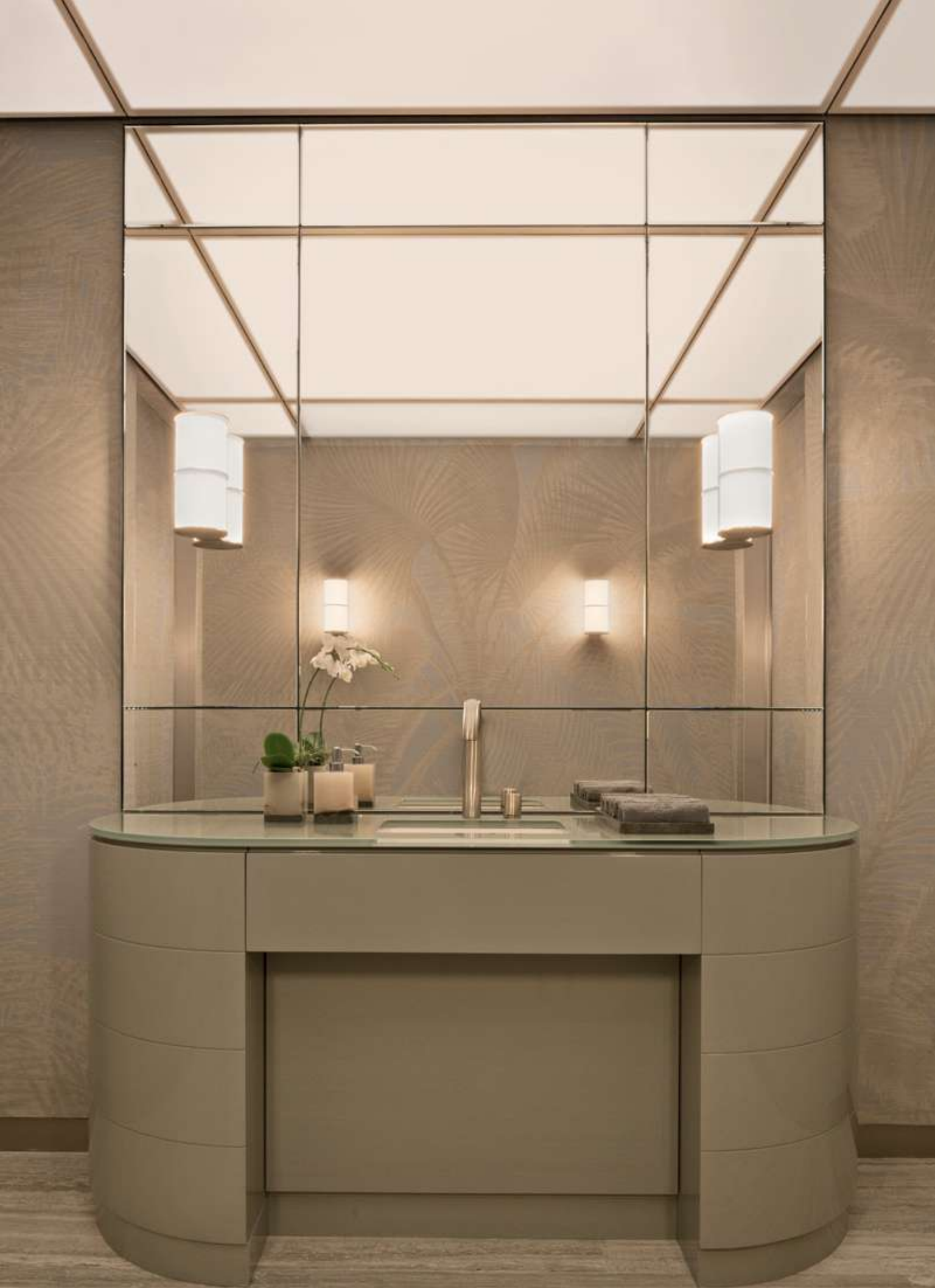
BATHROOM SUITE RESIDENCES BY ARMANI/CASA DESIGN CENTER