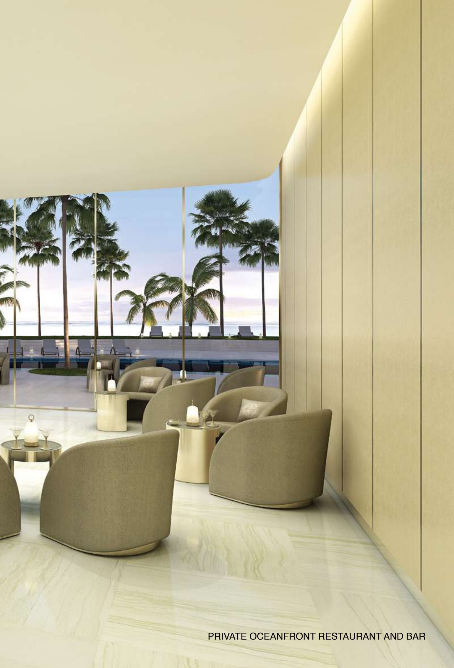
PRIVATE OCEANFRONT RESTAURANT AND BAR