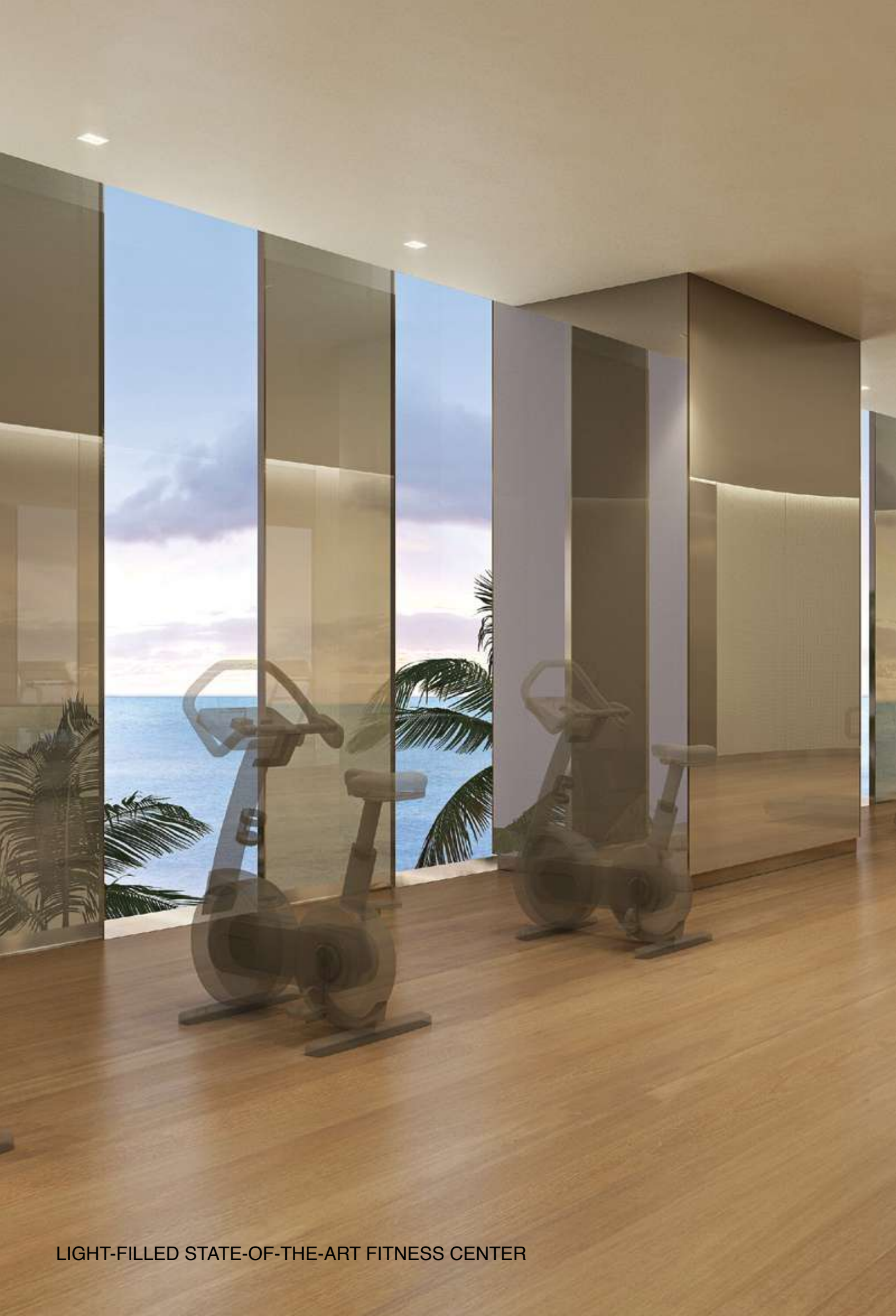
LIGHT-FILLED STATE-OF-THE-ART FITNESS CENTER